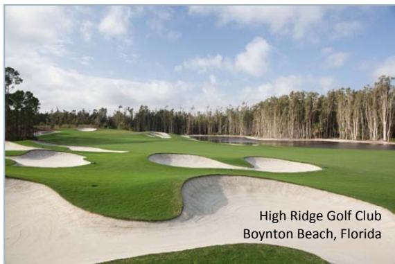
High Ridge Golf Club Boynton Beach, Florida