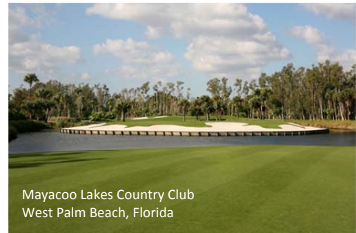
Mayacoo Lakes Country Club West Palm Beach, Florida